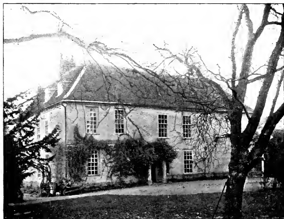
AN OLD COTTAGE, TOPPESFIELD, ENGLAND. THE RECTORY, TOPPESFIELD, ENGLAND.